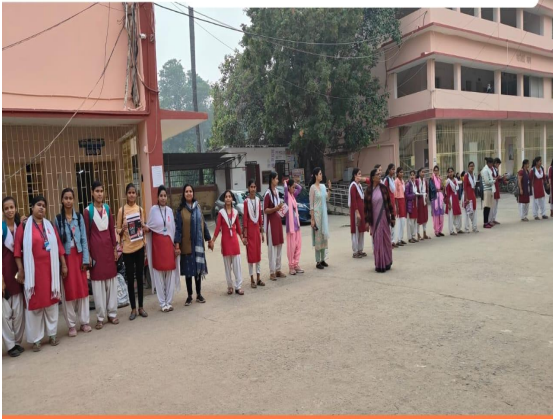
Human Chain to Promote Awareness against Child Marriage & Dowry

Sri Arvind Mahila College, Kazipur, Patna