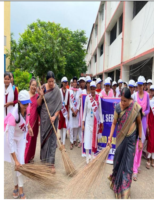
NSS DAY 24.06.2022