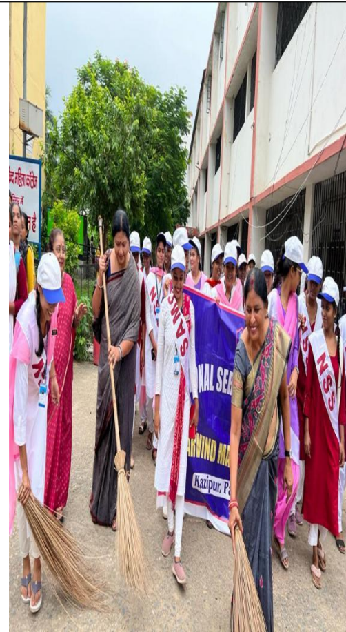
NSS DAY 24.06.2022