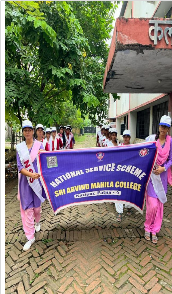
NSS DAY 24.06.2022